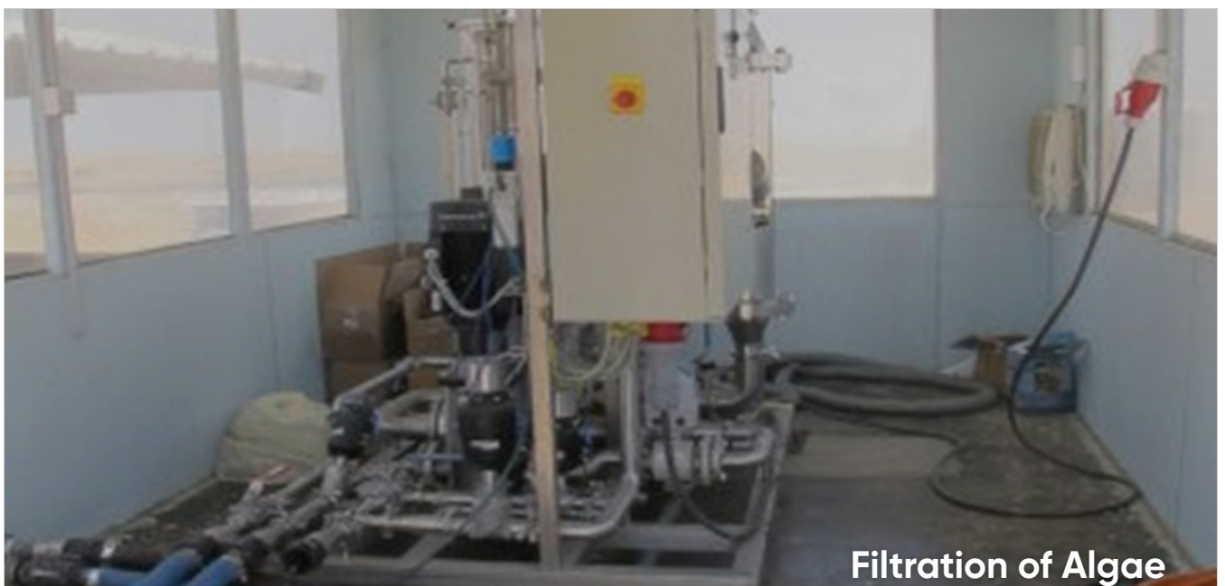
Filtration of Algae