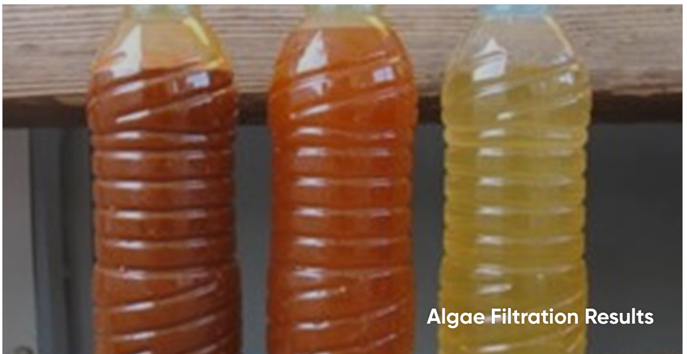
Algae Filtration Results